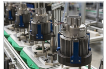
Industrial Electrical (Electric Motors & Circuit Breakers)