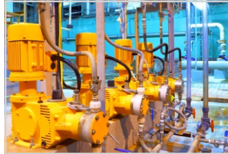
Fluid Machinery (Pumps, Fans & Valves)