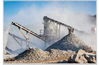
Cranes & Conveyors