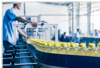
Bottling, Canning & Packaging