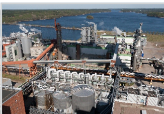
Process Industry (Fertiliser, Sugar, Paper & Pulp)