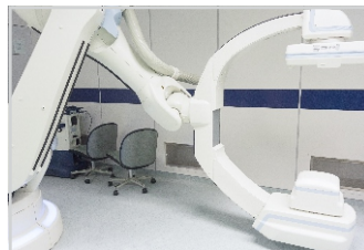
Medical (X-Ray & Imaging Equipments)