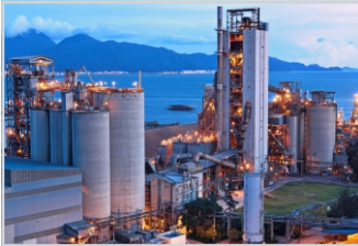
Cement, Mining & Minerals